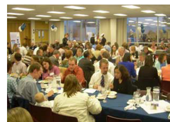
Students and faculty enjoy a nice meal in the Wilkinson Student Center.