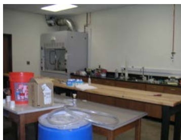
Left: Although not completely finished, the UO Lab has new rooms that are fully functional.

Many of you will recall days spent in the UO lab. We have and are giving the UO a face lift. Phase 1, completed a year ago, removed the process control center platform (affectionately called “the rameumptum”) and moved a couple of walls to create much cleaner lines for the main part of the lab, a new projects laboratory for support of student innovation work, and better accommodations for some of the new experiments that Mike Beliveau is bringing on line. Phase 2 of the UO remodel will be complete shortly to provide new paint, a drop-in ceiling, and some new experiments for the larger area of the UO lab. Additional changes within the department and its facilities are available through the department website ( http://www.et.byu.edu/cheme/ ) where you will find interesting news clips of department events as they happen.