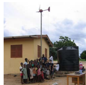
BYU and local students gather around the new windmill.