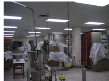
Right: A new suspended ceiling is installed.