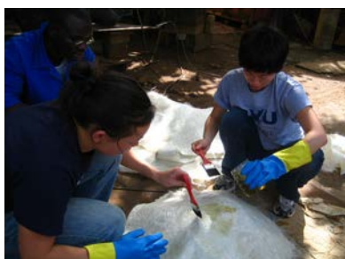
Students construct solar dishes, which help the locals to purify their water.