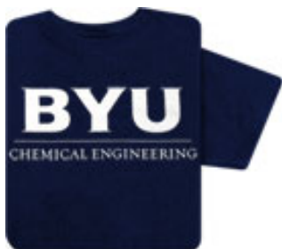
The new BYU Ch En T-Shirt.

BYU Chemical Engineering t-shirts, water bottles, and pens are available for purchase online through the BYU Bookstore/eStores. Go to byubookstore.com to order your ChEn merchandise now!