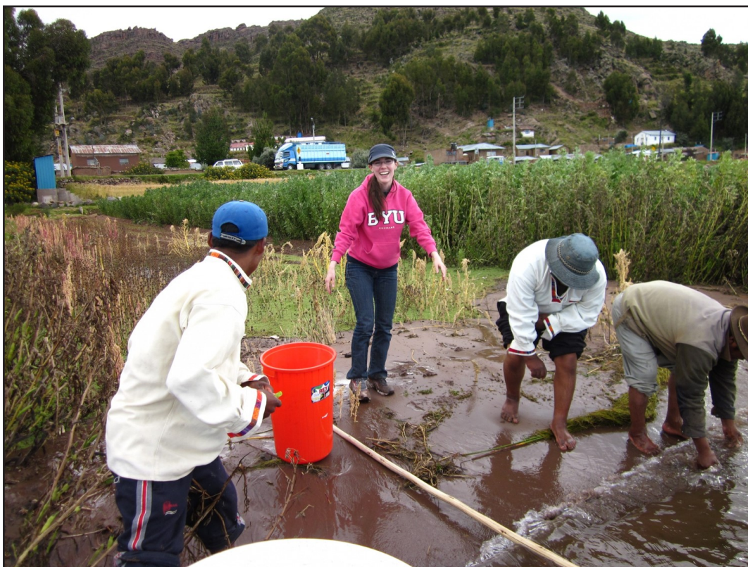
Chemical engineering undergraduate student working with Peruvians to implement a water filter on the Uros Islands, Peru. This project was part of the Global Engineering Outreach course.