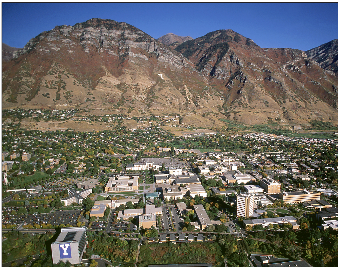
Brigham Young University, Provo, Utah.