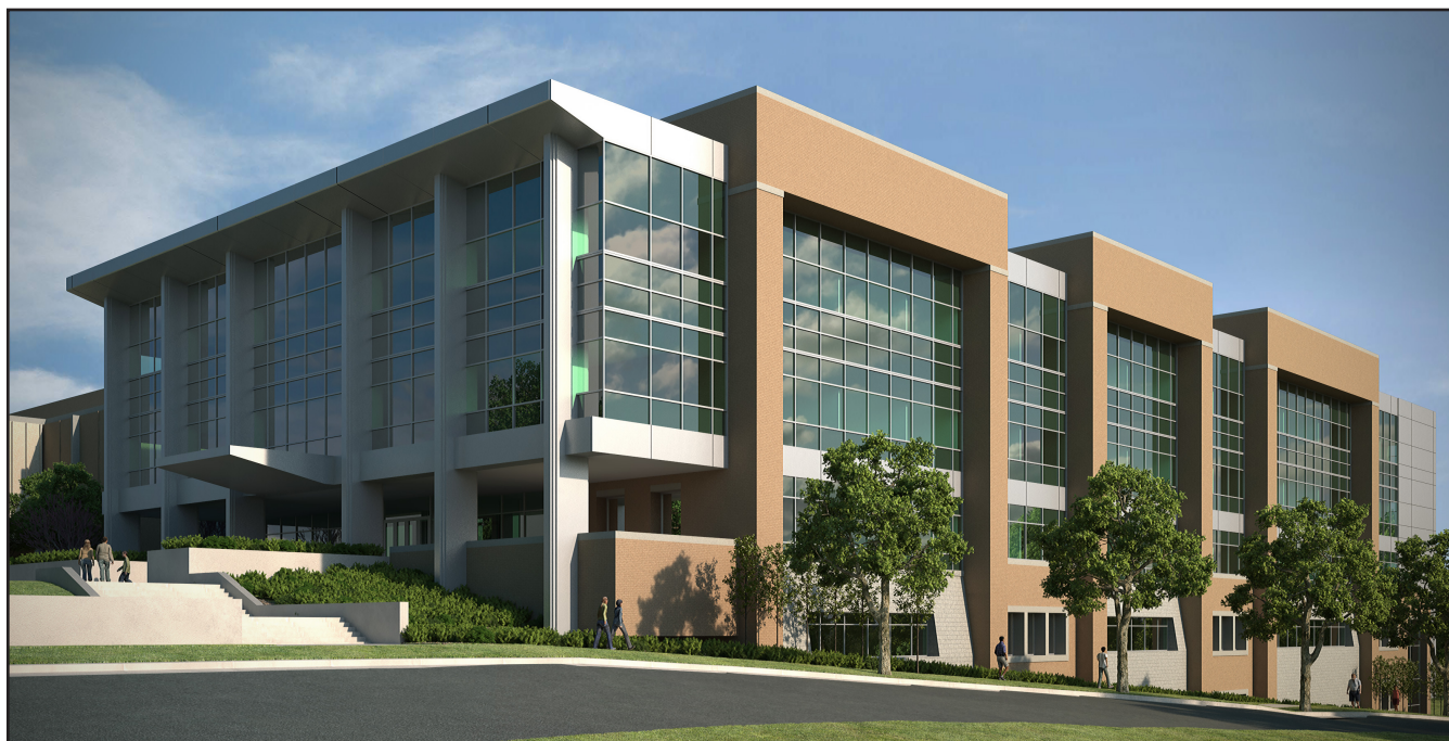
The new engineering building currently under construction. The building will open for classes in Fall 2018. Credit: Rendering Courtesy of VCBO Architects.

electron transport in porous electrodes and improvement of manufacturing processes for low-impedance electrodes.