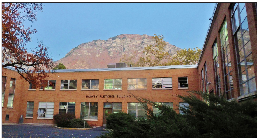
The Harvey Fletcher Building. The first engineering building at BYU.